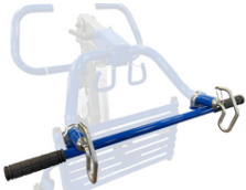
Handlebar (standard only)