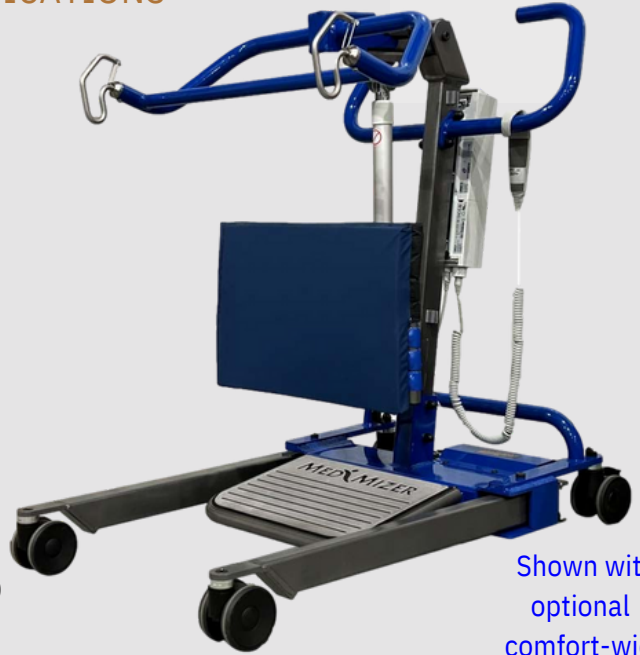
Shown with optional comfort-wide slingbar