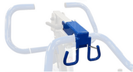
Seat Strap Mount