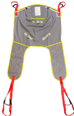
HighBack Sling (mesh) XL/XXL 1000lbs