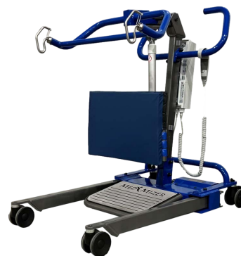
MedRiser STS 500lb